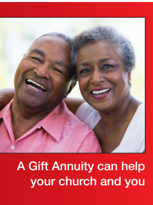
A Gift Annuity can help your church and you

A Gift Annuity is an irrevocable agreement in which a donor transfers cash or appreciated securities to the United Church of Christ in return for lifetime annual income of a fixed amount. Thereafter, the remaining principal benefits the organization designated by the donor (may be greater or less than original gift amount).