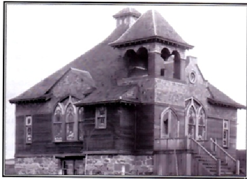
FLASHER UNITED CHURCH OF CHRIST BUILT IN 1912.

Throughout the almost one hundred years of existence, the Flasher United Church of Christ has responded to the needs of its community. The light of God's gracious presence has shown in our church beginning with the concerned Flasher citizens who organized the town's first Protestant church, the Congregational Church of Flasher, in May of 1908 to the present building which meets the accessibility needs of the members of the congregation.